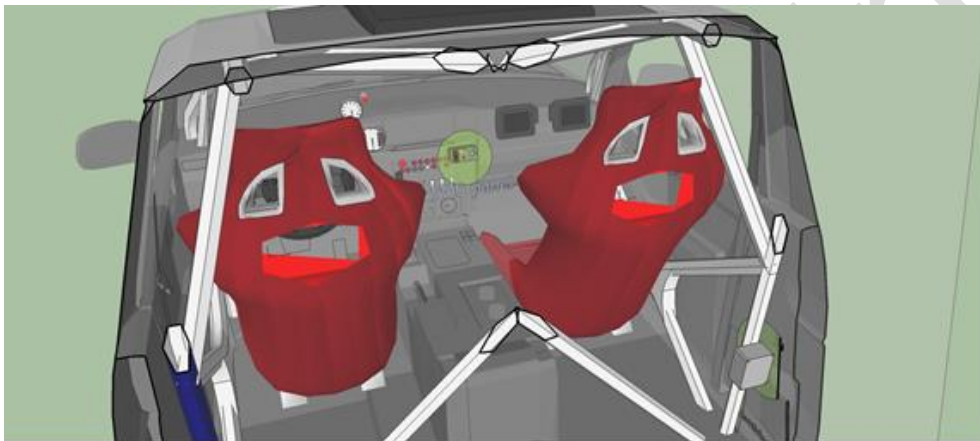
Pic. No. 5.: How to install 3.4