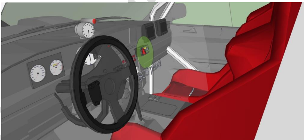
Pic. No. 6.: How to install 4.4

- To verify the functionality of the device will take place at the Technical Scrutineering.