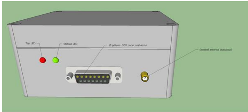
Pic. No. 1.: GPS box