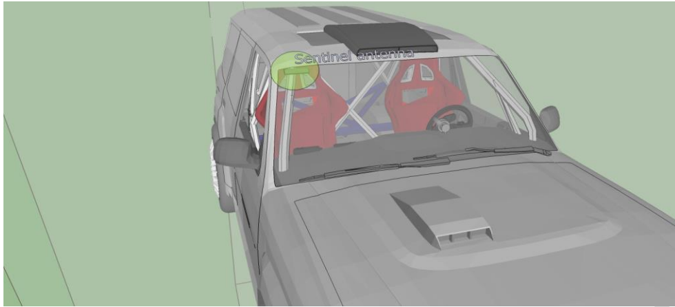
Pic. No. 4.: How to install 2.4